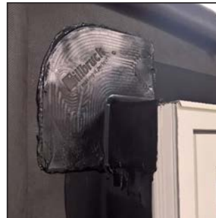
Fig 1: ME241 EPDM Corner, shown bonded after ME220 VV application (bond with OT015)

Safety data sheet must be read and understood before use.